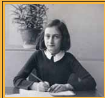
Anne Frank at her desk

Narrated by Kenneth Branagh, this 1995 film won the Oscar for Best Documentary Feature. It contains the only known footage of Anne herself: a brief glimpse, aged 12, watching a wedding party from her balcony. She is perhaps Hitler's best-known victim, but what was Anne Frank really like? There will be a speaker and discussion – and wine & nibbles. Suggested donations: £5. For bookings: 0117 927 7977.