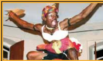
Jenako Dance Ensemble with World Jungle

“One World Many Cultures” – World Jungle takes centre stage at Cabot Circus, bringing the streets to life with music, song and dance from around the world: a breathtaking carnival procession, workshops and stalls.