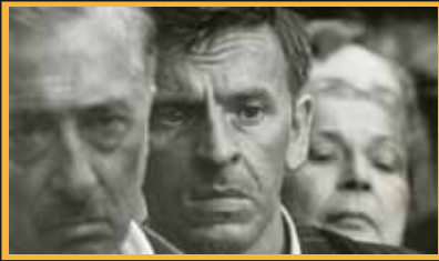
The Shop on Main Street

Oscar-winning Czech film by Jan Kadar. An inept peasant is torn between greed & guilt when Nazi bosses appoint him "Aryan controller" of a Jewish widow's button shop. Humour & tragedy fuse in this scathing exploration of complicity in the horrors of totalitarianism. £4.50 (+ concs). 0117 924 4512.