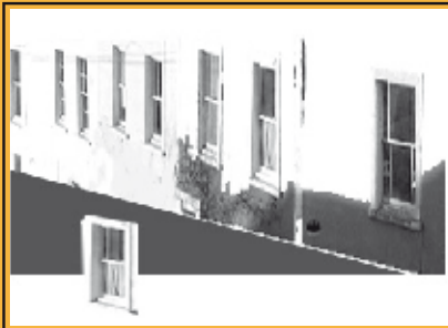
Songs of Belonging

SUNDAY 17TH MAY, 7.30PM, PIERIAN CENTRE.